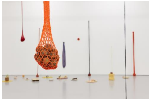
Veronica Ryan, Along a Spectrum , 2021

fruits into disposable items, such as stacked mushroom trays and takeout containers.