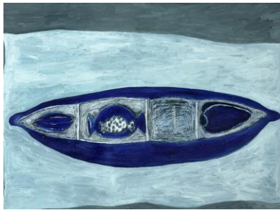
Veronica Ryan, Territories , 1986

motifs of fruits, seeds, and pods as subjects that convey growth and moments of transition and change.