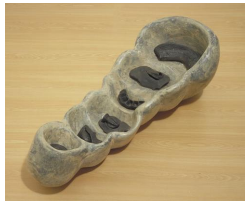
Veronica Ryan, Untitled , 1985

Among more than a hundred sculptures, textiles, and works on paper will be objects made of traditional art materials—i.e., bronze, marble, and plaster—as well as others sourced from such unexpected everyday items as seeds, pods, mango stones, orange peels, bandages, and plastic bottles. Ryan’s thoughtful reuse of organic materials in combination with mass-produced items suggests concerns around excess and consumption while also recognizing the unrealized potential of discarded objects.