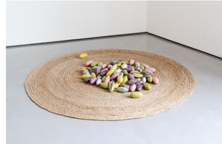
Veronica Ryan, Sweet Dreams Are Made of These , 2022

The last gallery returns to the motifs of fruits, seeds, and pods, exploring their many associations both personal and historical. A significant early floor sculpture shows the artist experimenting with the pod as a container as early as 1985. On loan from the Tate, the piece realistically depicts an empty pod, but one that is also clearly a container with compartments. Also here are two other floor sculptures: a monumental, green and spiky bronze Soursop (2021), depicting an uncannily oversized tropical fruit, and a pile of brightly colored ceramic cocoa pods at the center of a round jute mat, entitled Sweet Dreams are Made of These (2022). In these sculptures, seeds and fruit connote nurture and natural abundance. The gallery also sheds light on Ryan's interest in the flip side of that abundance—waste and consumerism—with sculptures made from food packaging. In this grouping, Ryan embeds precious bronze-cast seeds and