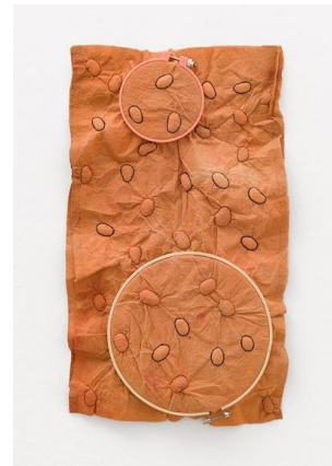
Veronica Ryan, Collective Moments III , 2000/2022

A number of monumental, framed lead pieces are encountered upon entering the Main Gallery. The multipart work entitled Cavities (1988) evolved out of one of Ryan’s earliest site-specific works Cavities in the Cloister Court . During a 1987-1988 residence at Jesus College in Cambridge, Ryan cut lead pieces into shapes that replicate the panes of the college chapel’s rose window, which is joined together by lead. She then placed these shapes into shallow holes she dug in the ground in the outdoor court to form a sunken imprint of the rose window. After the run of the installation, Ryan flattened and mounted them onto paper to create Cavities . The artist’s transformation of these fragments reflects the value she places on residues and remainders as well as her interest in transformation of objects into something altogether new.