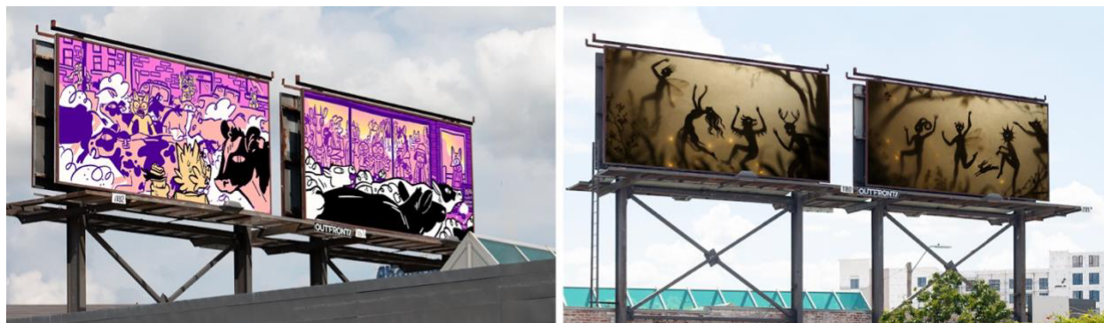
October-December 2025: Max Diabick (West), Nora Snyder (East)