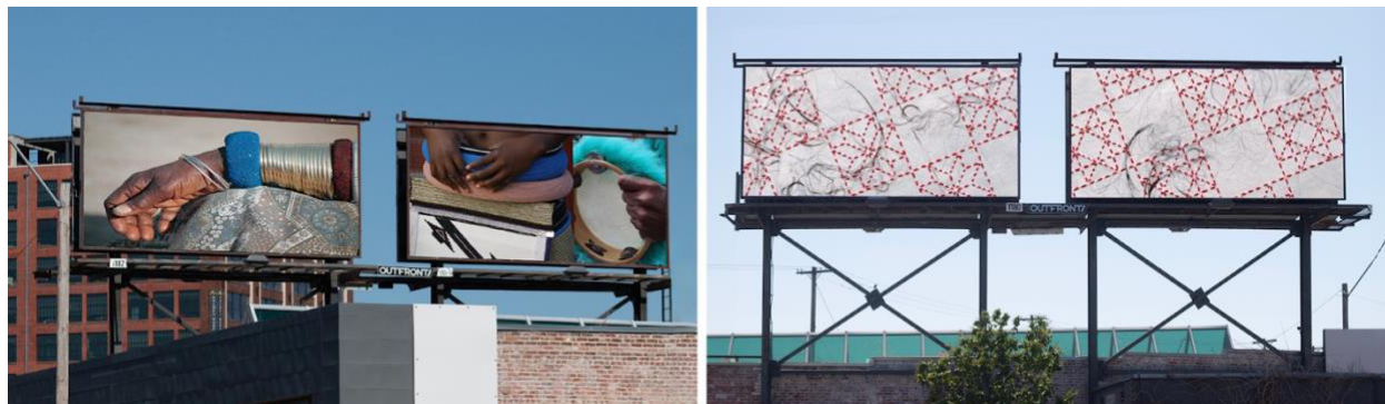
April-June 2025: Adrienne Hoard (West), Yulie Urano (East)

The 2025-2026 Crossroads Artboards schedule is as follows: