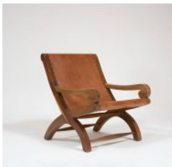
Clara Porset, Miguelito Armchair , 1960. Collection Cuban Modern.

In the 1970s, as domestic demand for furniture grew and with the island facing restrictions on the importation of embargoed goods and materials, the regime segued from the Dujo brand to EMPROVA. Also led by Cordoba and Caignet, EMPROVA furniture employed a modular approach using distinctive dark wood frames with contrasting natural rattan inserts. The exhibition contains several examples of the EMPROVA line, including some small furnishings and accessories.