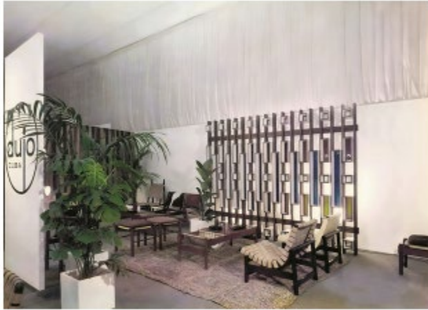
Dujo Muebles showroom at the Salon International du Meuble de Paris , 1967. Collection Laura Córdoba.

A Modernist Regime: Cuban Mid-Century Design is organized into the following sections to explore the eras of design that emerged in Cuba in the 1960s through the 1970s: