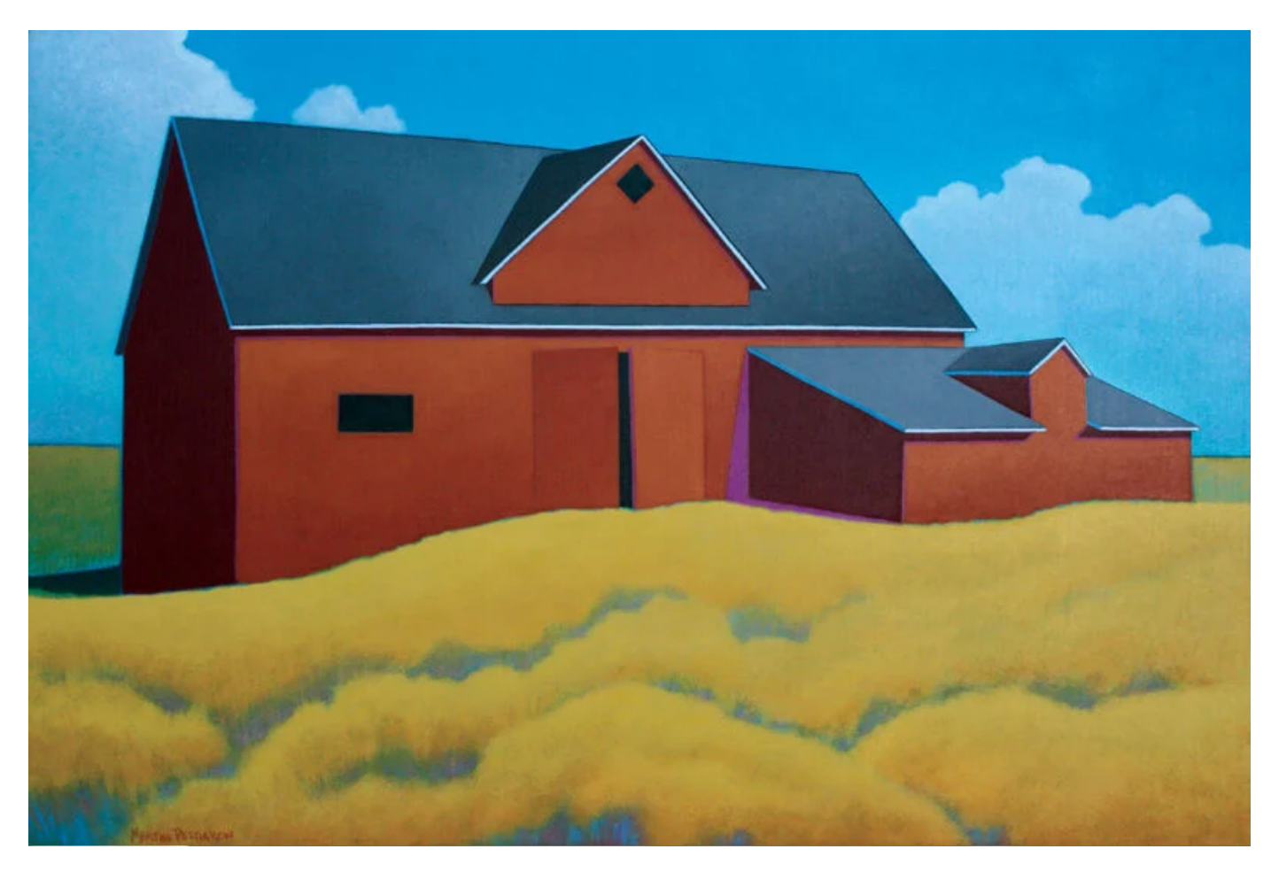
"Abandoned" by Martha Pettigrew, 2021, 24 inches by 36 inches, oil

EARNEY — An online auction of more than 120 pieces of art will benefit the Museum of Nebraska Art, April 2-7.