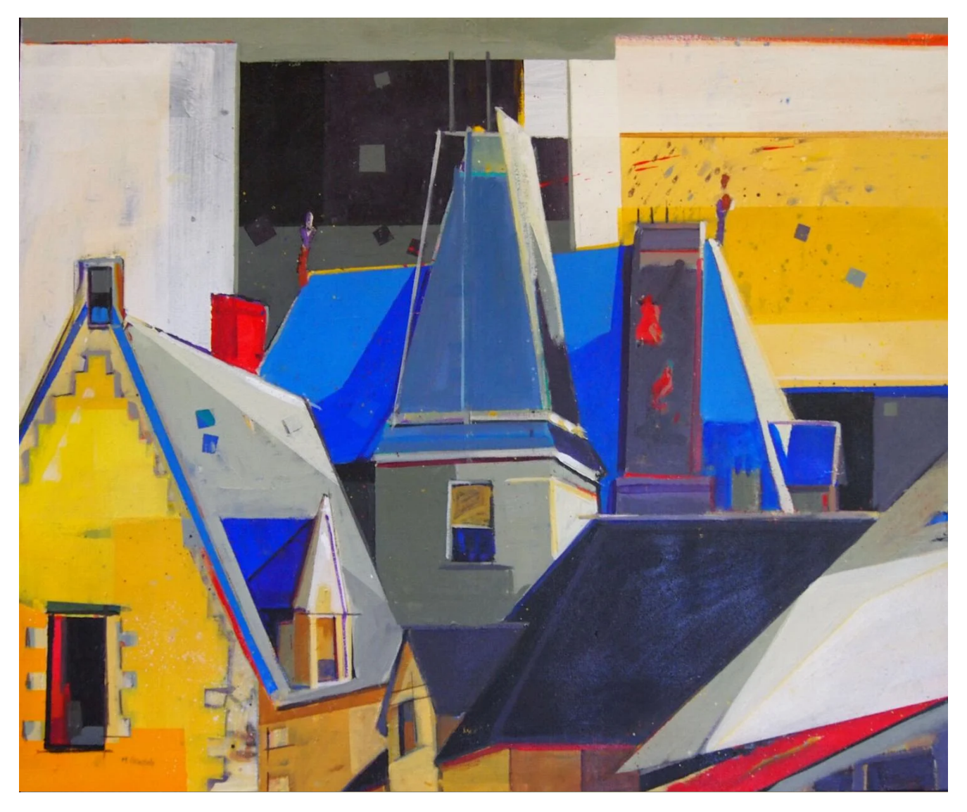
"Amboise Abstract" by Milt Heinrich, 2015, 32 inches by 38 inches, acrylic Museum of Nebraska Art, courtesy

Proceeds from the "SPIRIT: A Celebration of Art in the Heartland" online auction will support participating artists as well as the Museum of Nebraska Art, enabling the museum to further its mission of celebrating the history of Nebraska's visual art for diverse audiences. It also funds exhibits the highlight the work of artists with Nebraska ties or who created artworks that reflect the culture of Nebraska.