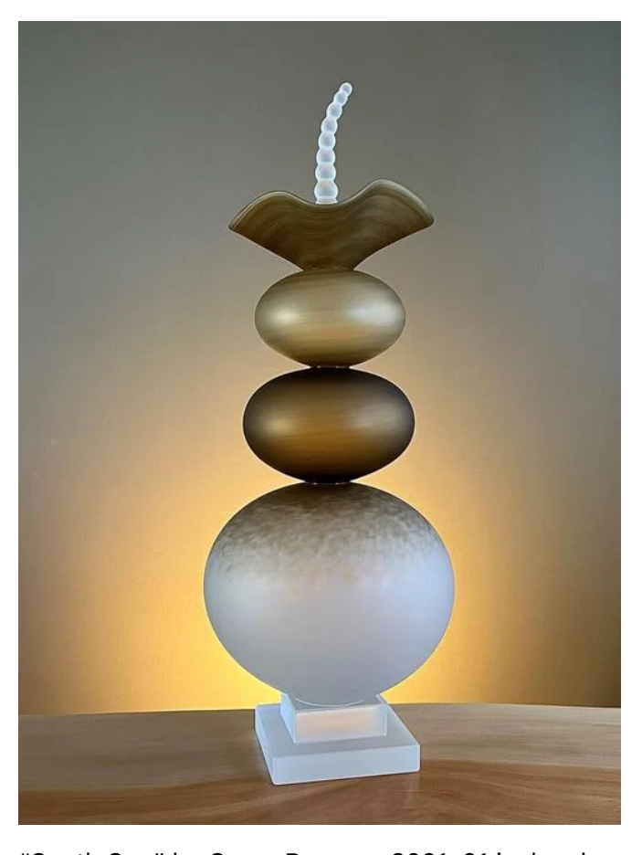
"South Sun" by Corey Broman, 2021, 21 inches by 7 inches, glass Museum of Nebraska Art, courtesy

The Museum of Nebraska Art is embarking on a new era and is closed through 2023 for a restoration, renovation and expansion project. Currently the MONA staff continues to operate by creating engaging offsite and online programming opportunities for all ages.