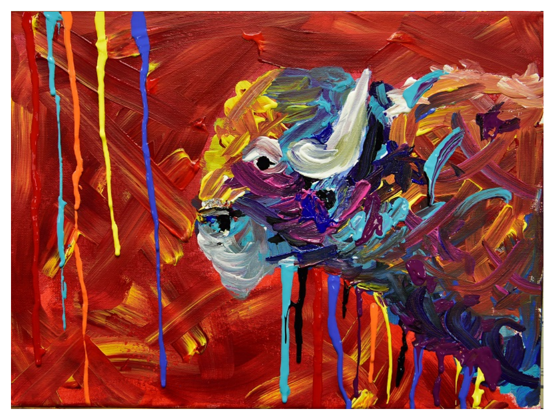
Art by Easton Schwartz of Selby.