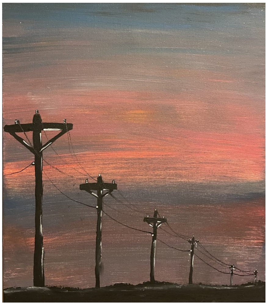
Art by Aine Graesser of Chamberlain.