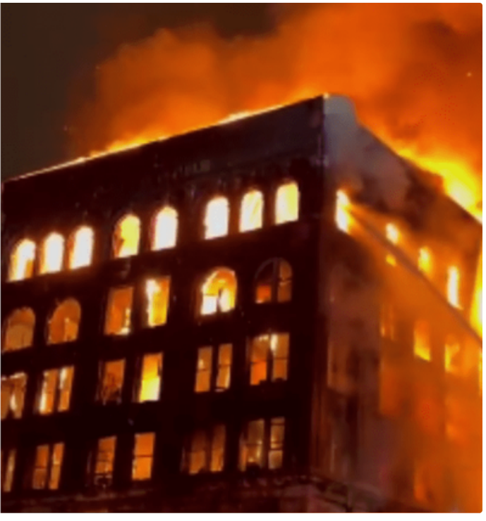
The historic Masonic Temple in Ohio, Zanesville was engulfed in flames

The Masonic Temple in Ohio's city of Zanesville reportedly caught fire late Thursday night, January 6. The historic building is home to several art studios. It's not known yet how the tallest building in the city caught fire and if there is any injury or fatality.