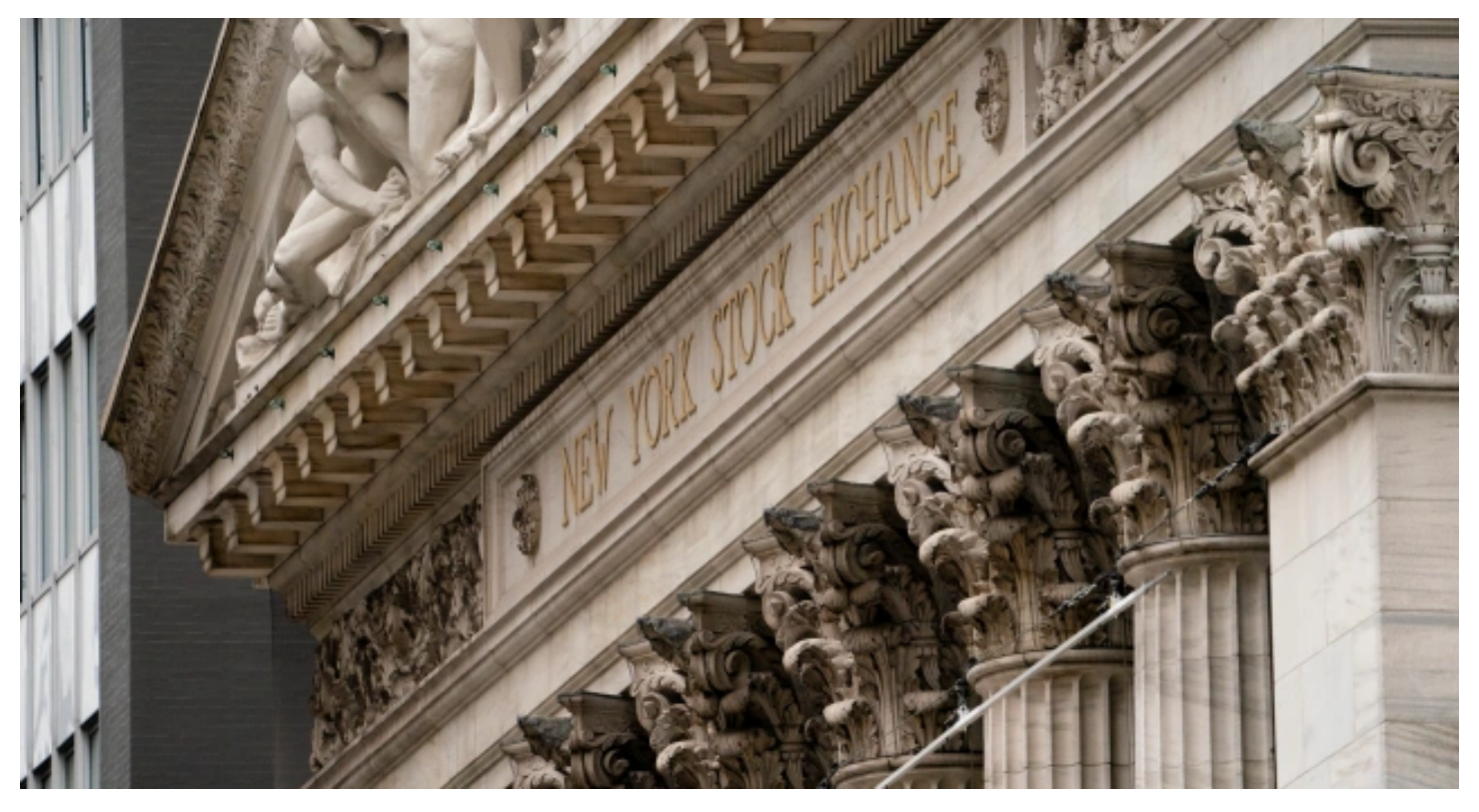
Stocks sink on new COVID variant; Dow loses 905 points

by The Associated Press via Nexstar Media Wire / Nov 26, 2021