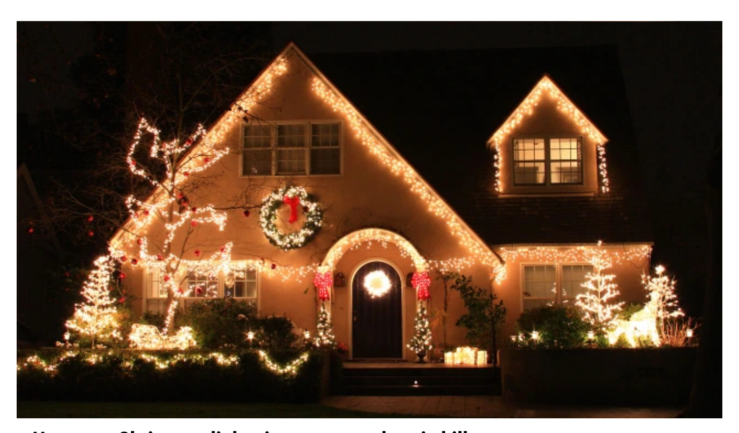
How your Christmas lights impact your electric bill