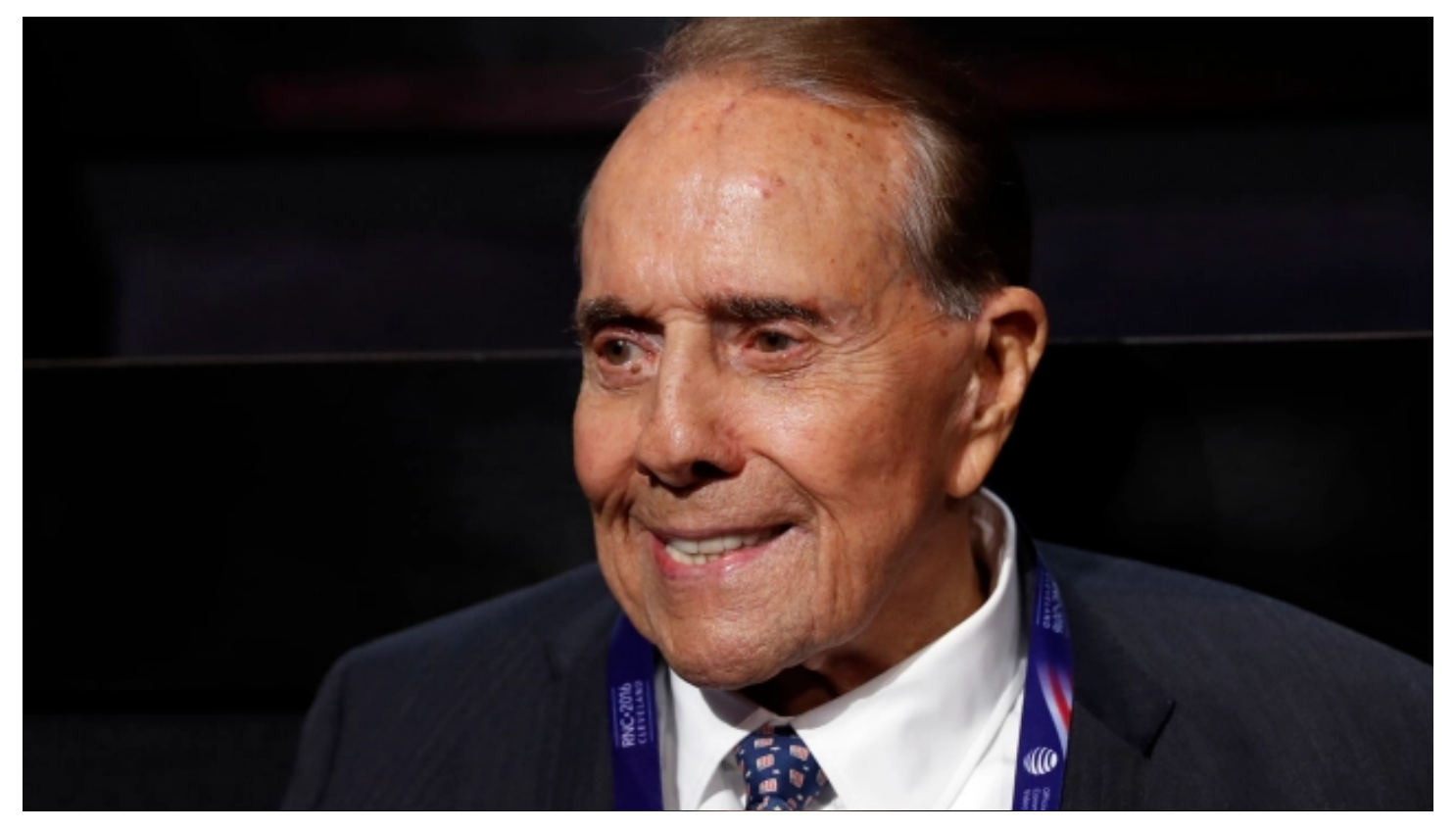
Bob Dole, Senate leader and presidential candidate, dies at 98

by The Associated Press via Nexstar Media Wire / Dec 5, 2021