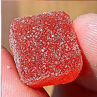
"Nature's Morphine", Could Help Against Joint Pain & Arthritis behealth.space