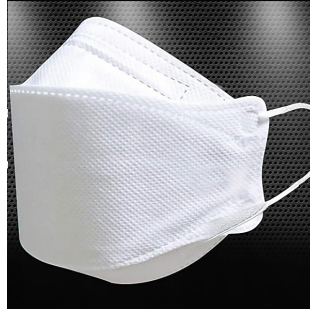
The New Comfortable Mask Is Taking Kansas City By Storm Hilipert™ KF94 MASK