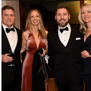
The Most Successful Lawyers In Kansas City. See The List Attorneys | Sponsored Listings