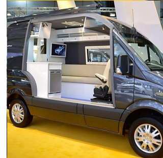
Unsold Camper Vans For Pennies On The Dollar Camper Van Warehouse | Search Ads