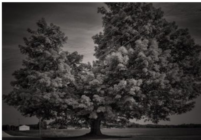
Image 1: Suzanne Rose, 44°48'06.1"N 87°22'15.5"W (Maple with Directional Cut Crown) , 2017

West Bend, WI – The Museum of Wisconsin Art (MOWA) is pleased to present its upcoming exhibition, Suzanne Rose—Blind Spot: to pass among them , at its Milwaukee satellite location MOWA | DTN.