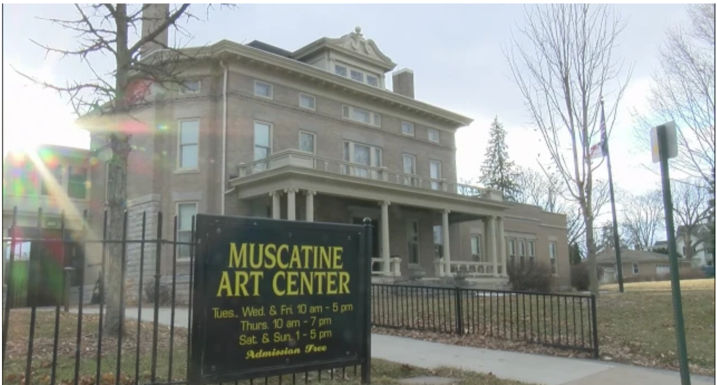
Muscatine Art Center